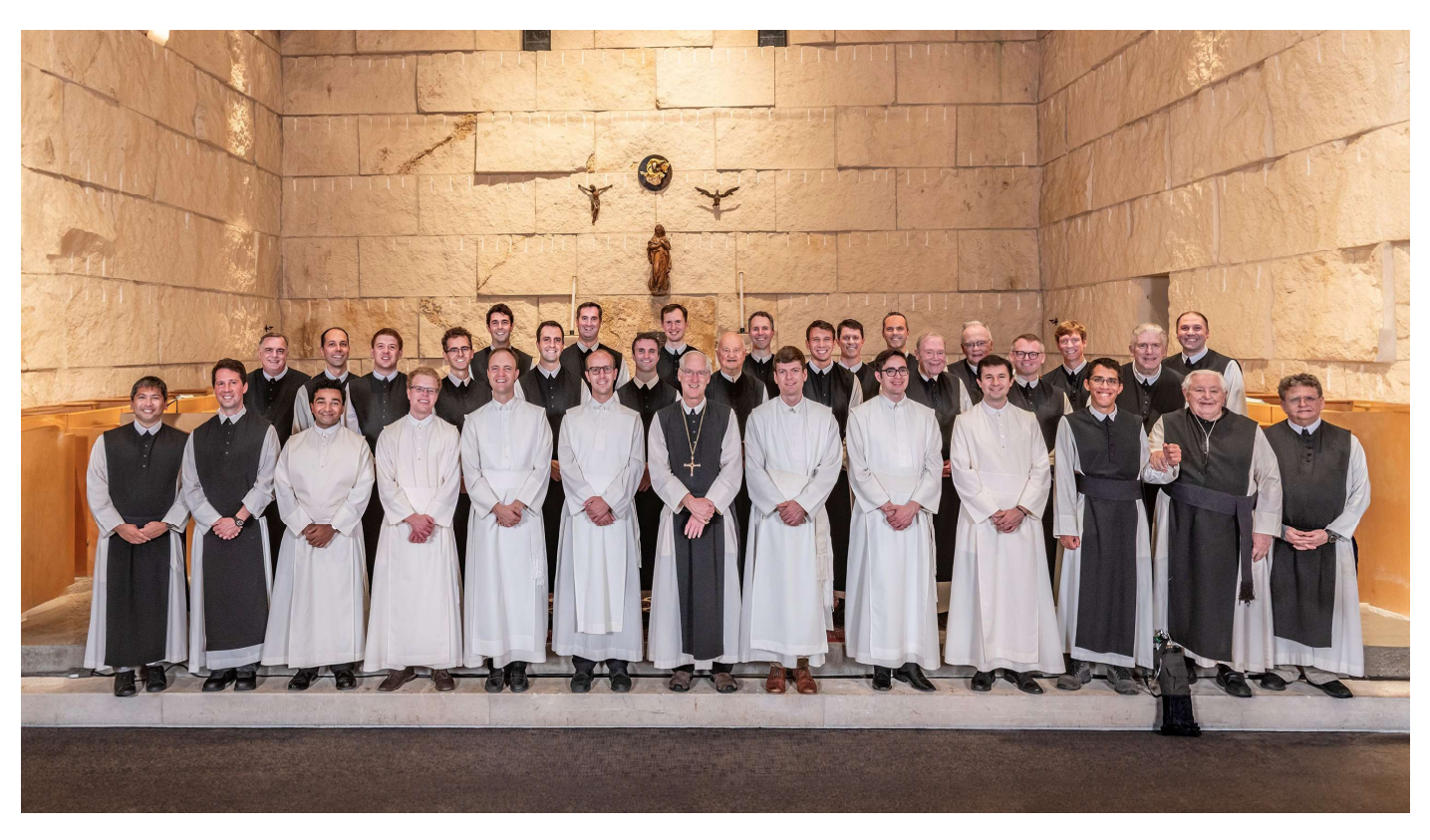
Merry Christmas from the monks at Our Lady of Dallas Cistercian Abbey!

Morning Prayer - 6:00 a.m. Adoration - 5:30 p.m. Evening Prayer - 6:00 p.m. Daily Mass - 6:35 a.m. Mass on Sunday - 9:00 a.m. Confessions Wed. - 4:00-5:00 p.m.