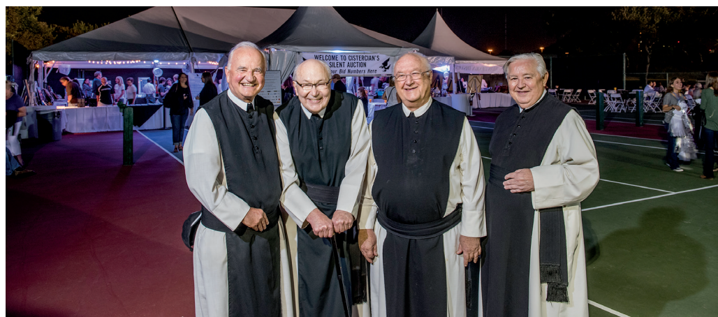
Cistercian Abbey Our Lady of Dallas 3550 Cistercian Road Irving, Texas 75039