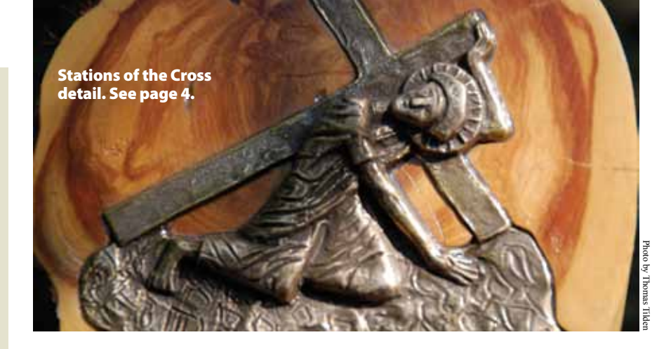
Cistercian Abbey Our Lady of Dallas 3550 Cistercian Road Irving, Texas 75039

Note: First Friday Masses are held only during the school year; they are not offered during the summer months.