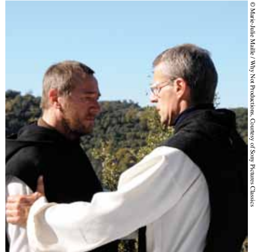
The Trappist Cistercians in "Of Gods and Men" find faith, hope, and love in the face of Algerian terrorists.

Their lives are filled with prayer, study, the simple manual labor needed to support themselves, and a ministry largely by