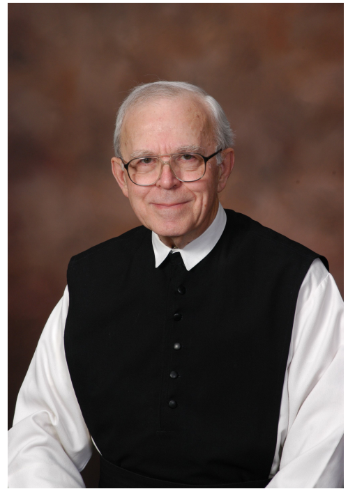
2005, age 77