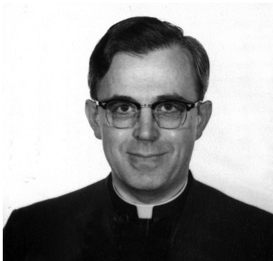
1975, age 47